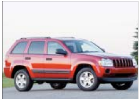
JEEP GRAND CHEROKEE